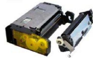
*3512-86-EL Easy Loading version

**under certain driving conditions & using recommended paper