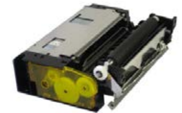
*3512-86-KS Kiosk version